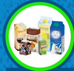
Food & Beverage Cartons

Keep items loose, clean & dry. Always flatten your cardboard.