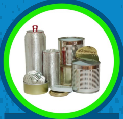
Metal Food & Beverage Cans