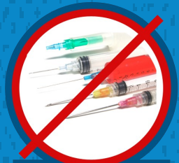
Sharps & Needles

For a more detailed item list visit www.STLCityRecycles.com