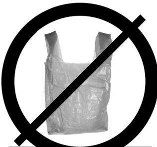
Plastic Bags & Film