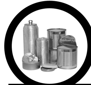
Metal Food & Beverage Cans