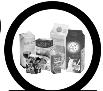
Food & Beverage Cartons

Keep items loose, clean & dry. Always flatten your cardboard.