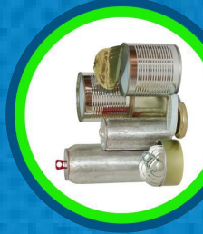
Metal Food & Beverage Cans