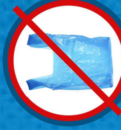
Plastic Bags & Film*