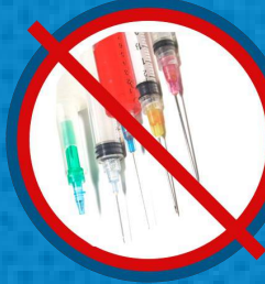
Sharps & Needles