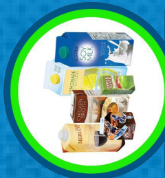
Food & Beverage Cartons

Keep items loose, clean & dry. Always flatten your cardboard.