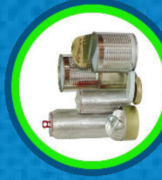
Metal Food & Beverage Cans