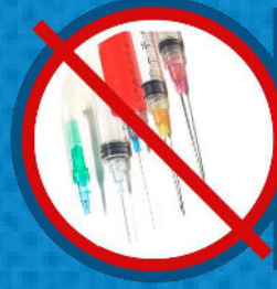
Sharps & Needles