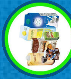
Food & Beverage Cartons

Keep items loose, clean & dry. Always flatten your cardboard.