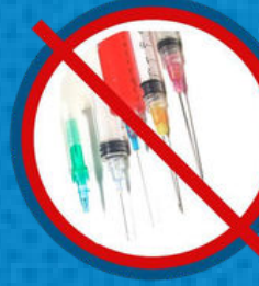
Sharps & Needles