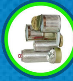
Metal Food & Beverage Cans